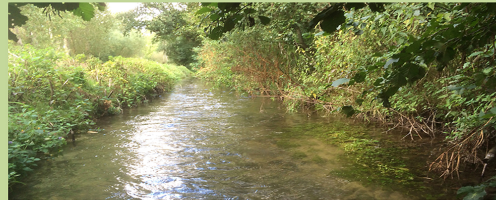
River Avon- Beat 22 (Upper)