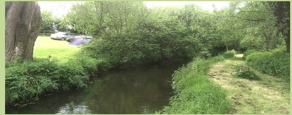
River Avon - Manningford (Upper)