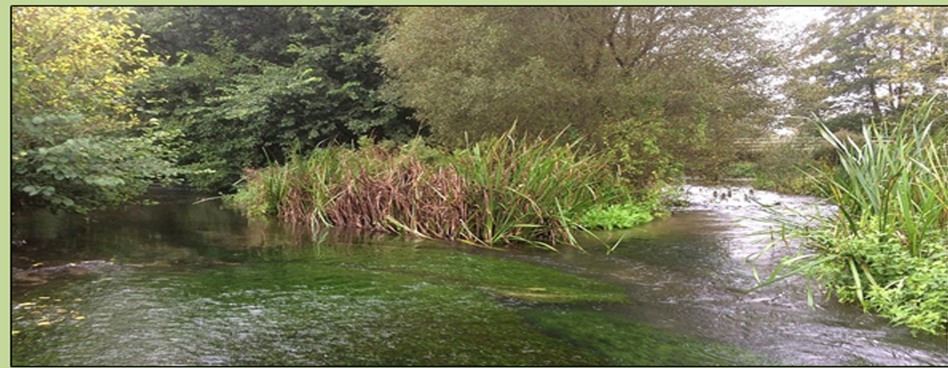
River Nadder - Burcombe Bridge Autumn 2017 / Spring 2018